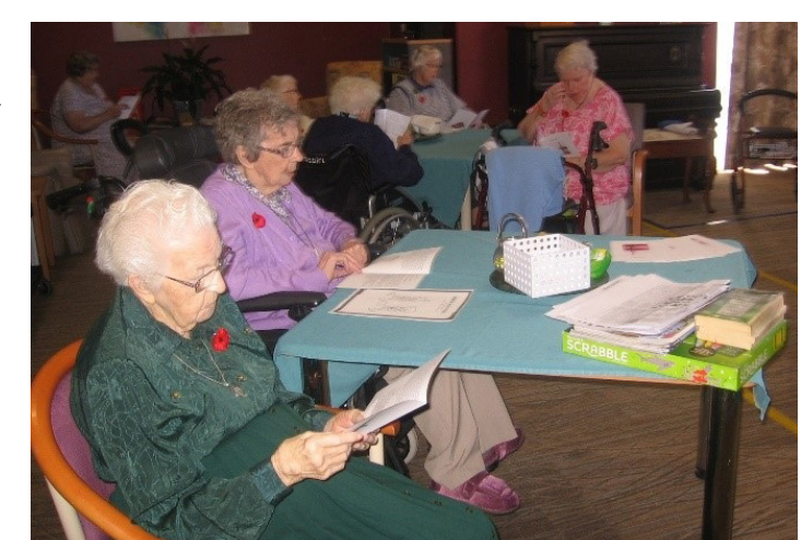
Residents at Tenison Aged Care during the Anzac Day service.

May God bless all who have sacrificed their lives and help us to honor their memory with upright lives.