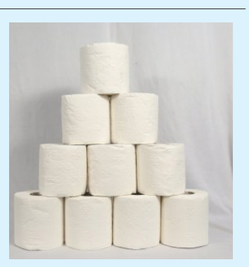
According to a Carroll Col lege Broulee Facebook post, students have been hard at work understanding the complex geometric properties of toilet paper pyramids.

darks arts of escape and evasion by avoiding their clutches and leaving the trap in pieces.