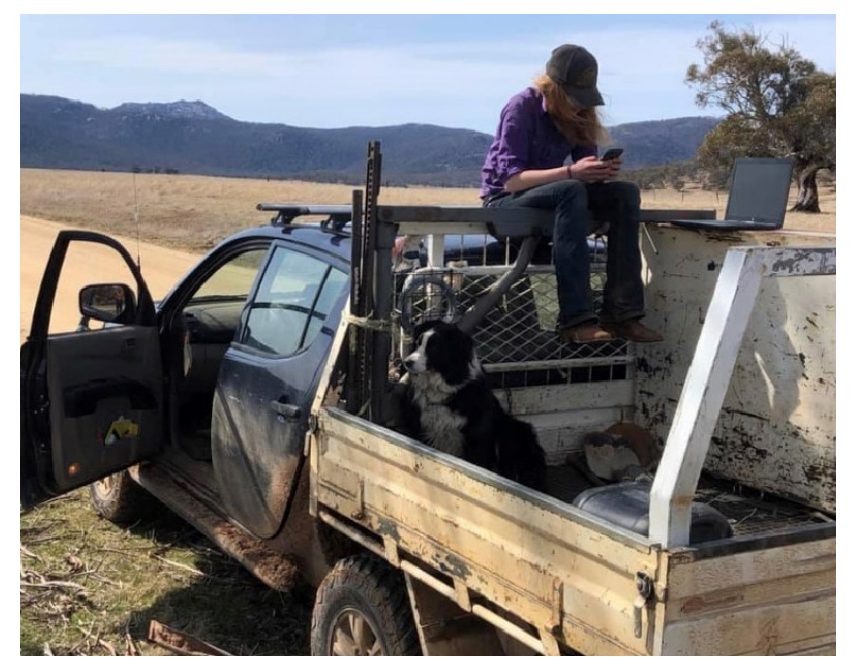
Students from St Patrick's Cooma, engaging in remote learning