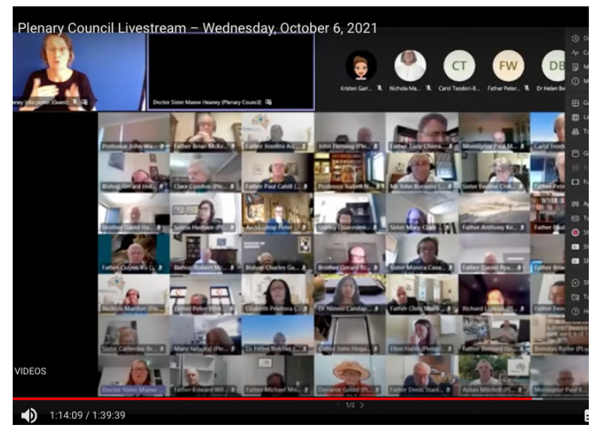
Screenshot from the daily summary presentations

"Truth-telling around this part of our story is really im-