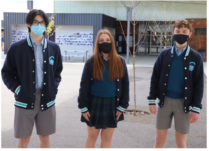
A handful of Year 12 students from St Mary MacKillop College Canberra have started Term 4 on campus.

Almost three quarters of parents and carers of Australians aged 15 to 18 have reported worsening mental health in their children over the past year, according to analysis from the Australian National University.