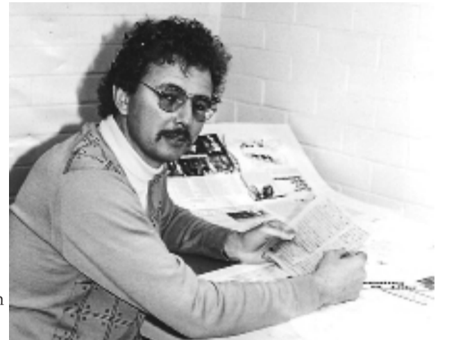
Working at the light table in Perth Catholic Education

However, he is looking forward to stepping down.