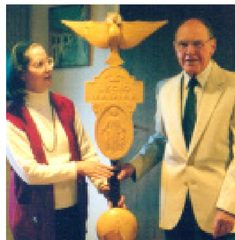
The Legion's handcrafted Banner 1998