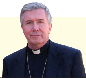
Archbishop's Message Archbishop Christopher Prowse

It's never too cold to go outside. That's what clothes were invented for. You will feel better for it.