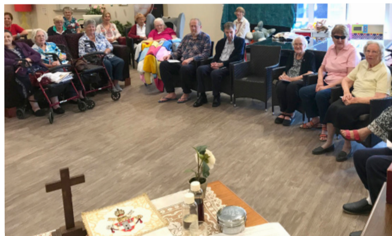
Celebrating Mass at the nursing home in Cooma